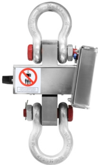
Crane scale MCW09: side view