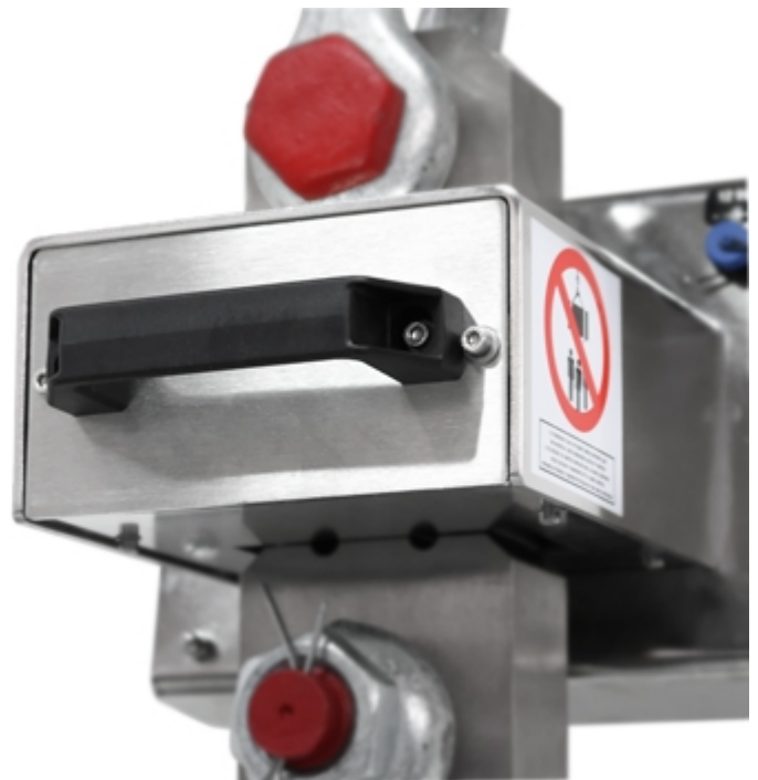
Crane scale MCW09: extractable battery view